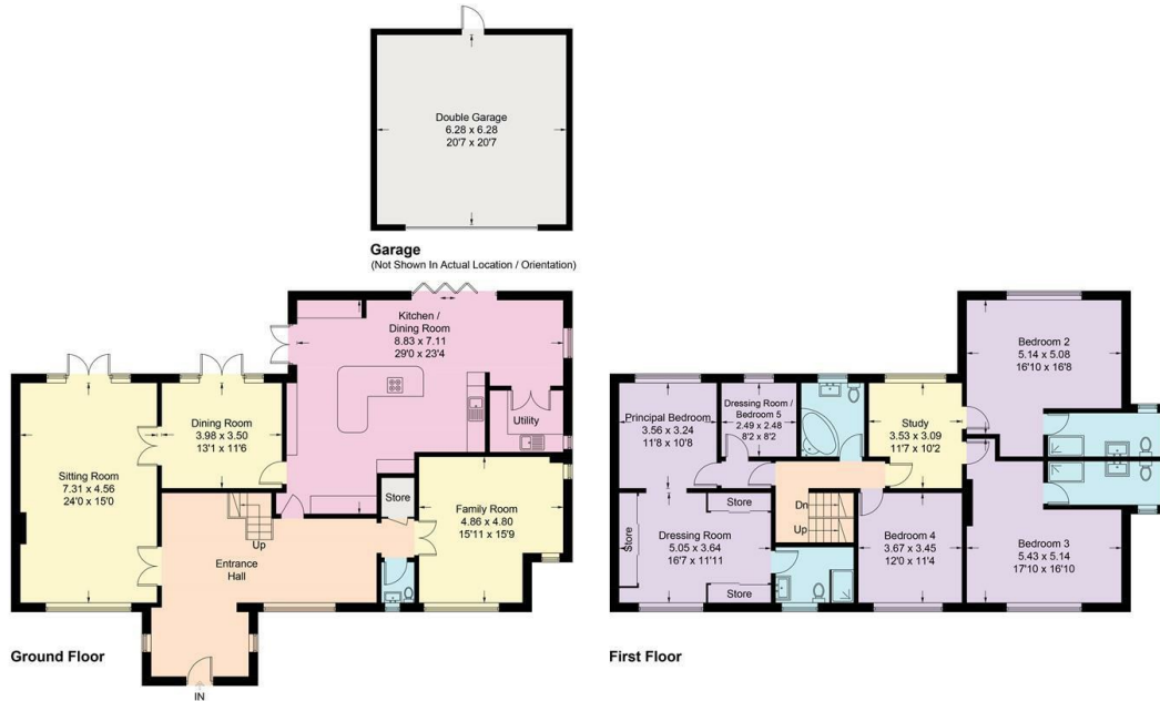
Illustration for identification purposes only, measurements are approximate, not to scale. Fourlabs.co © (ID1203067)